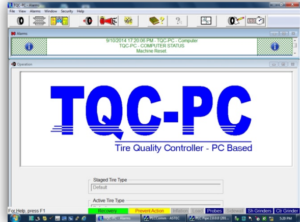
Windows® 7 – TQC-PC® Uniformity Machine Controller

Please consult a Sales Representative to find out what machine controllers are currently available to receive the Windows® 7 Upgrade by email at micropoise.cdsales@ametek.com .