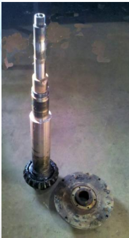
Worn D70 Spindle & Rim Adapter in need of repair or replacement

Micro-Poise Uniformity machines are rugged and designed to last for years of service. However, over time, any machine may experience age related wear and require maintenance.