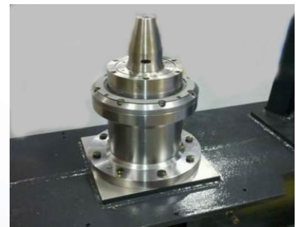
ASTEC Lower Spindle Assembly